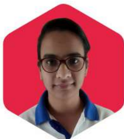
Umita Patidar Index Medical College, Indore