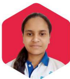
Sakshi Seltiya Govt. Medical Collage - Shivpuri