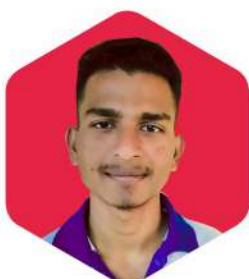
Praful Badole Atal Bihari Bhajpayee Collage - Vidisha