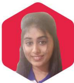
Pranjal Kag Index Medical College, Indore