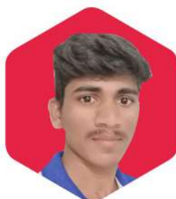
Kuldeep Gothre Govt. Medical Collage Ratlam