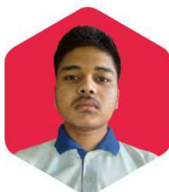
Lokesh Dawar Index Medical College Indore