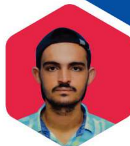
Pawan Kag Govt Medical Collage Khandwa